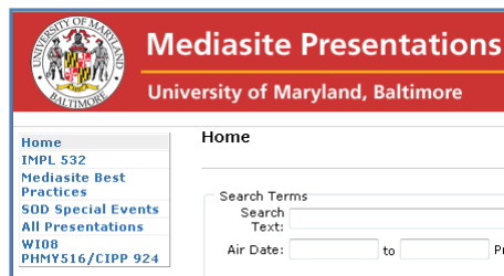
Figure 1: Public Video Content

While some video content is available to the general public, most posted content, including School of Pharmacy lecture videos requires individuals to login for access.