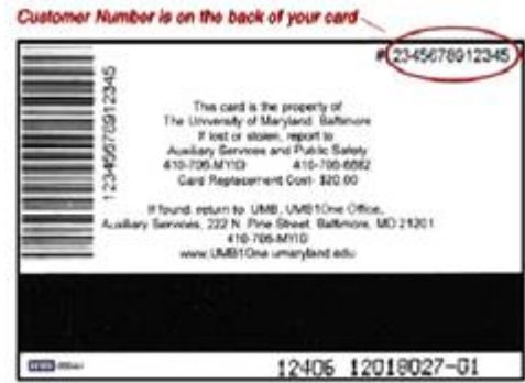
Figure 1: UMB One Card ID Number

It is important that you enter your UMB One Card ID number on multiple choice exams. Look on the back to locate your ID number (figure 1). The UMB One Card ID number is NOT the same as your SURFS Student ID number. Students entering this number or another random number WILL experience difficulty when quizzes/exams are scored. It can take a significant amount of time to match up a student and a number that is not the UMB One Card ID number. Help avoid confusion by carrying your ID .